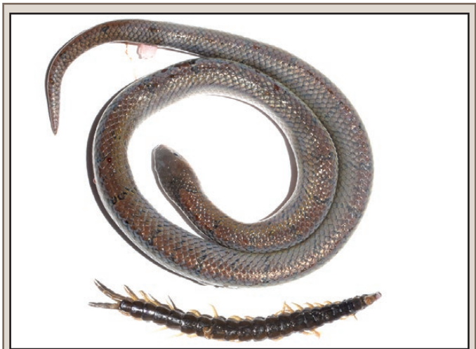
FIG. 1. Oligodon cinereus with centipede prey, from Guwahati city, Assam, India.

OLIGODON CINEREUS (Günther's Kukri Snake). DIET. Apart from a few well-known guilds of snakes that specialize on centipedes as prey, there are relatively few documented records of generalist snake species preying on these formidable invertebrates. In one instance under laboratory conditions, Sistrurus miliarius was seen to prey upon Scolopendra viridis (Farrell et al. 2018 J. Herpetol. 52:156–161). At ca.1815 h on 9 August 2018, we found a dead male Oligodon cinereus killed by locals in the Basista area of Guwahati city, Assam, India